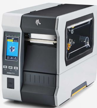
ABOVE: Zebra Label Printer