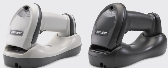
BELOW: Barcode Reader