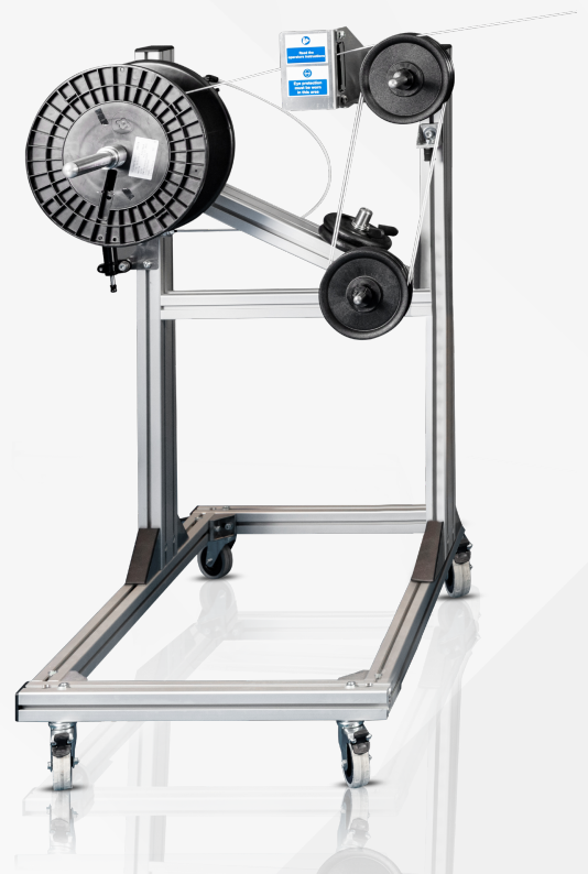
ABOVE: Single Floor Standing Unpowered Dereeler

The Nova 50-100i has been designed for both ease of use and maintenance. Hinged doors and easy access panels provide quick access to all parts of the machine. Alignment of the laser beam to the wire for set up and maintenance is undertaken simply via the PC in Class 1 laser mode. No flash lamps or water filters to change - the new long life diode packs are rated for 20,000 hours operation.