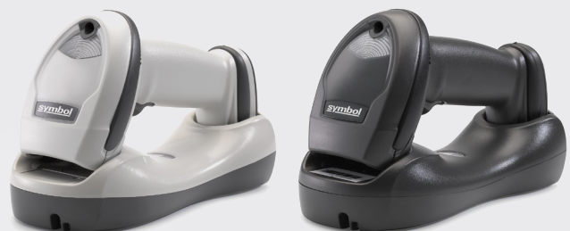
ABOVE: Linear Barcode Machine Readable Codes