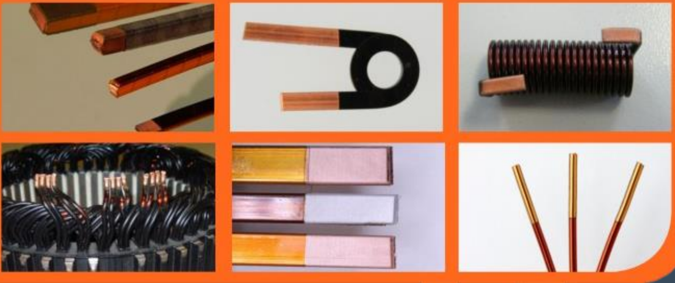
Above: examples of components and magnet wires stripped using Spectrum's patented laser magnet wire stripping process.

SIENNA 900 is a modular laser magnet wire stripping system designed for integration into medium to high volume production lines, new or existing, manufacturing wound components and other products using enamel insulated "magnet wire".