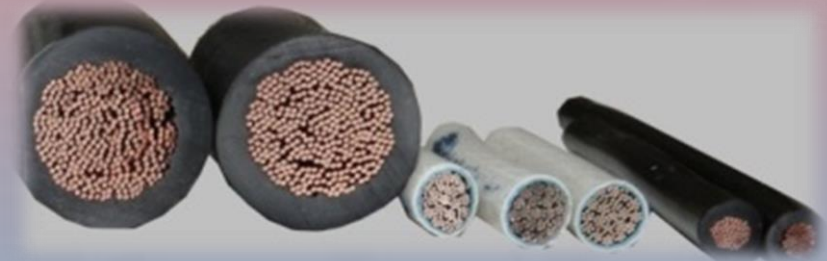
Measure & Cutting