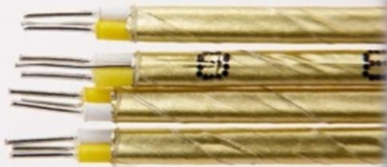
Measure & Cutting